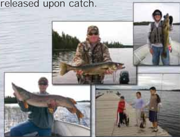
(We clean, filet and wrap your catch and store the fish in our freezer until departure.)

We are a trophy catch and release lodge. Therefore any walleye over 18" and any pike over 27.5" must be released upon catch.